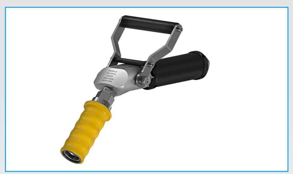
FV103-4-01A-G - 45° Fill Valve & P36 NGV1 Nozzle

CNG and Bio-Gas dispenser for car, bus and truck filling & CNG Bio-Gas trailer load/unload systems.