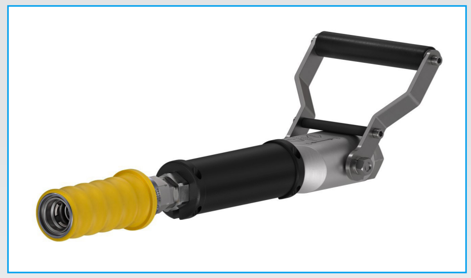
FV103-0-AD6-G - 180° Fill Valve & P36 NGV1 Nozzle

CNG and Bio-Gas dispenser for car, bus and truck filling & CNG and Bio-Gas trailer load/unload systems.