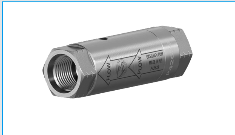
IB102-6AXXP - Vent Hose Breakaway (Only For Vent Hose)

Vent hose breakaway designed for use with both public and private CNG refueling stations.