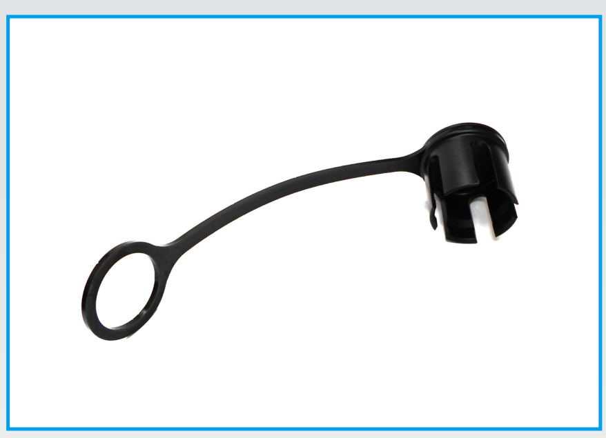
HC308-DC - 1" Quick Release Coupler Dust Cap