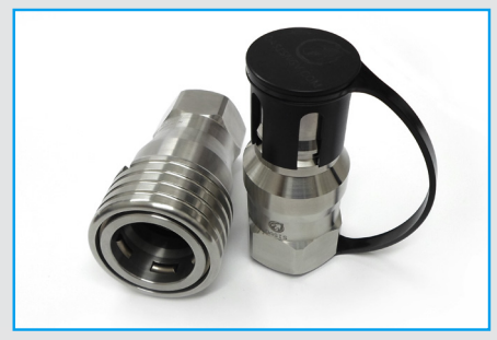
HC308-6NDDN - 1" Quick Release Coupler

Fast Flow Filling Systems, Storage Cascade to Trailer/Transporter, Trailer/Transporter connection to Daughter station and direct feed to CNG Dispensers. Suitable for CNG, Hydrogen and Bio-Gas.