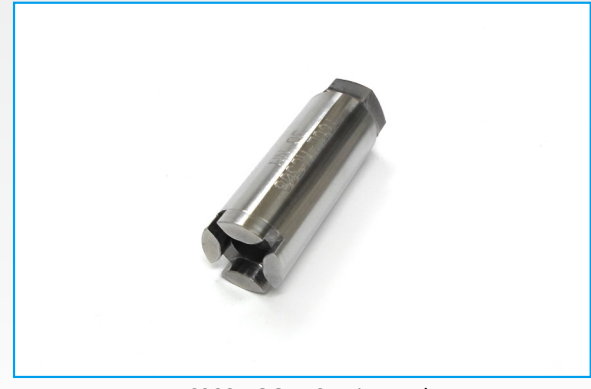
HC308-TOOL - Service tool