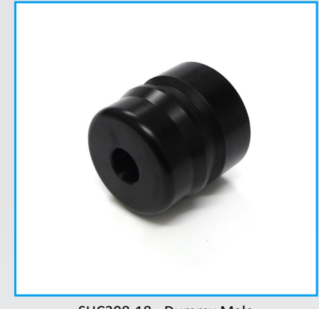
SHC308-18 - Dummy Male