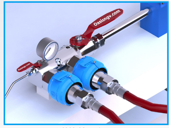
HC308-COVER in use