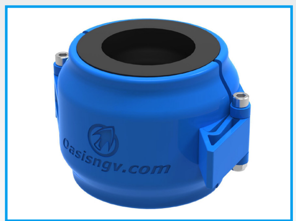
HC308-COVER - 1" Quick Coupler Ice Cover

The Oasis Ice Cover prevents ice build up on the HC308 Coupler while in use in cold climates or high flow applications.